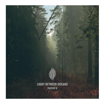
STUDIO ALBUM 2020