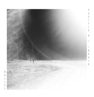
BULLET PACIFIC K x INGAJA 2022