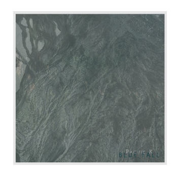
BLUE FALL EP DEBUT ALBUM 2017