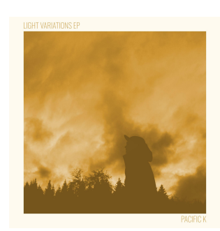
LIGHT VARIATIONS EP SOLO RELEASE 2021